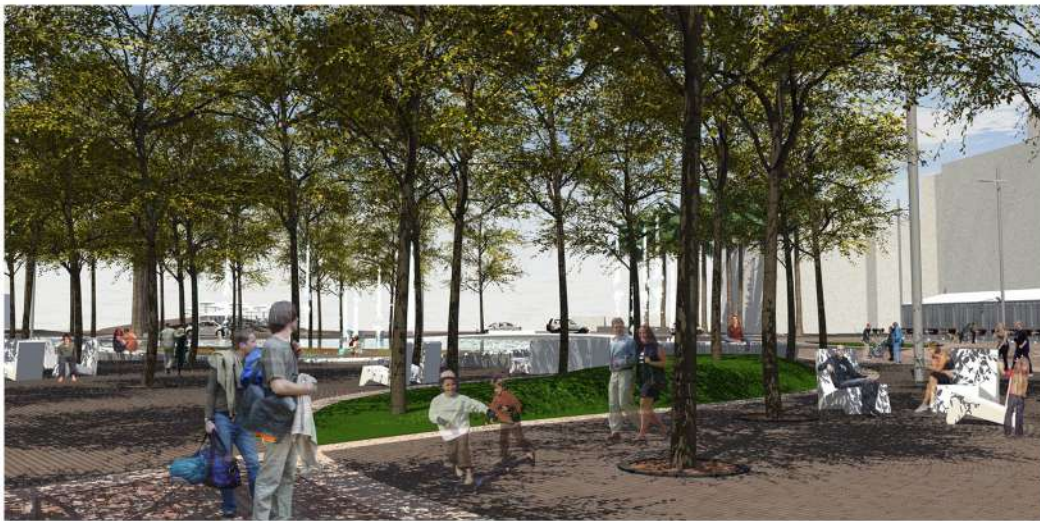
Haatzmaut square - a grove around a water element