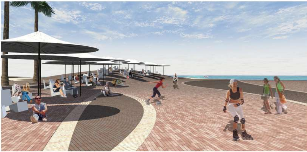
Haatzmaut square - a landmark project connecting the city to the sea