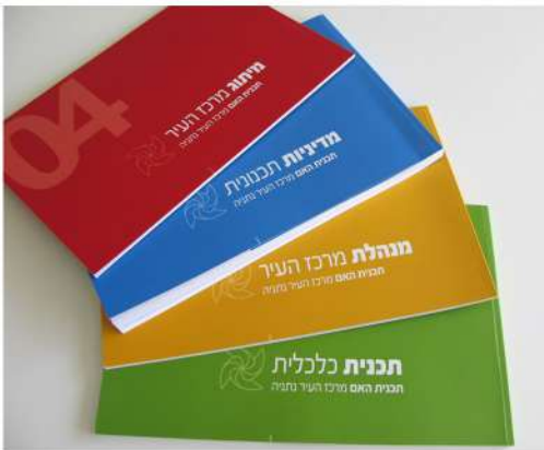
The Mother Plan's 4 booklets

Following the foundation of the new city center management, the current action items are a series of 5 temporary projects in the public realm, which will be constructed during 2009, the first one opening on June 2009.