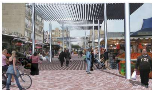
Hanotea Square and the market space - medium scale public space interventions