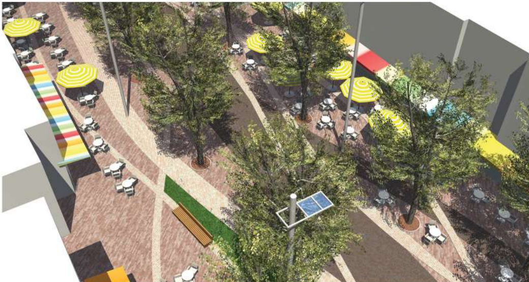
Herzl Street - the main high street as the vivid urban center of the city