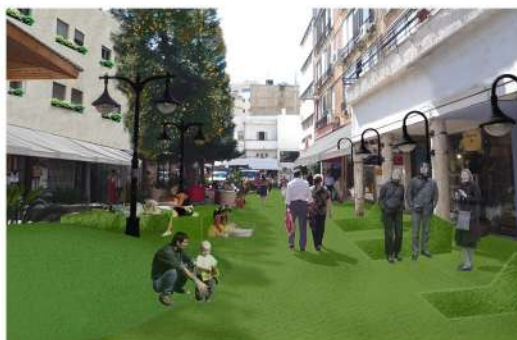
Two projects out of the series of the temporary projects