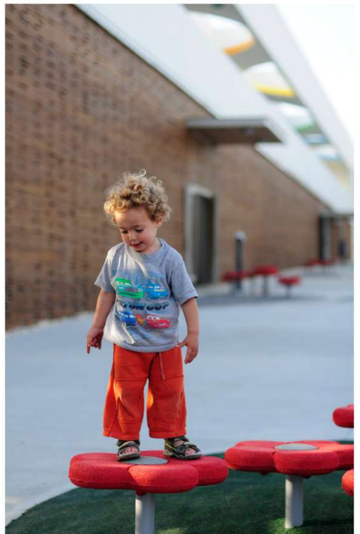
An inspiring environment is designed with a careful composition of materials and surfaces