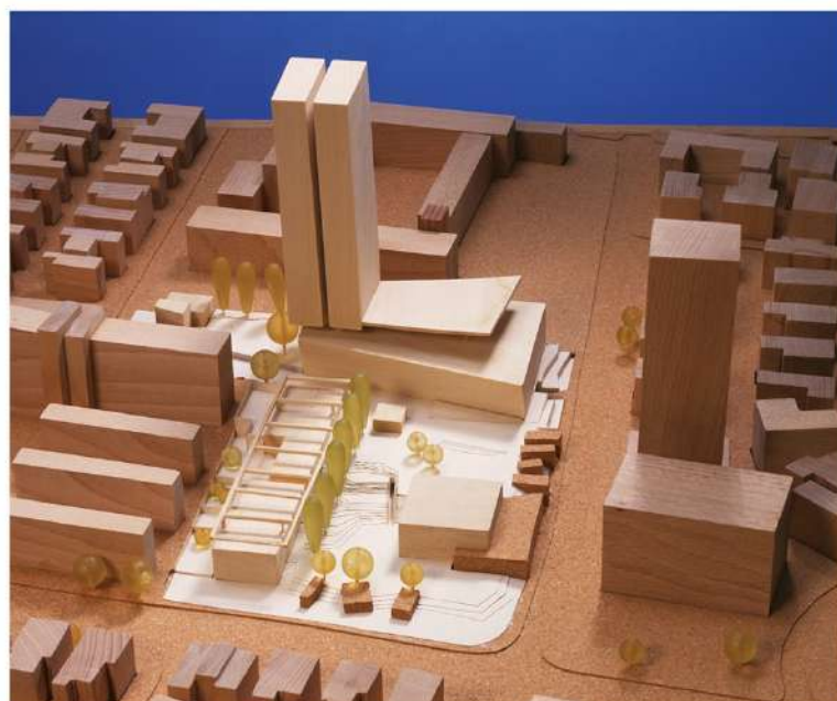
The winning proposal for the complex

The color spectrum is used in various ways and locations throughout the building, serving both as an orientation device as well as a sensual stimulus, operating within the framework of creating an inspirational learning environment for the children.