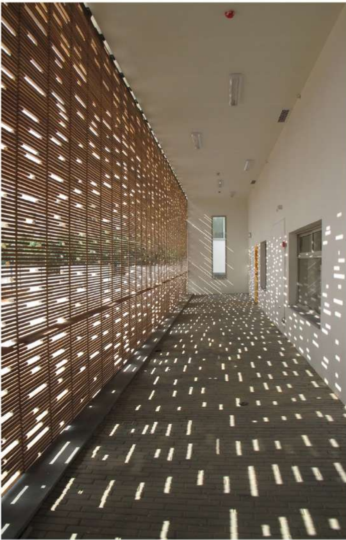
The unique woven timber fabric separates the public space from the children's realm