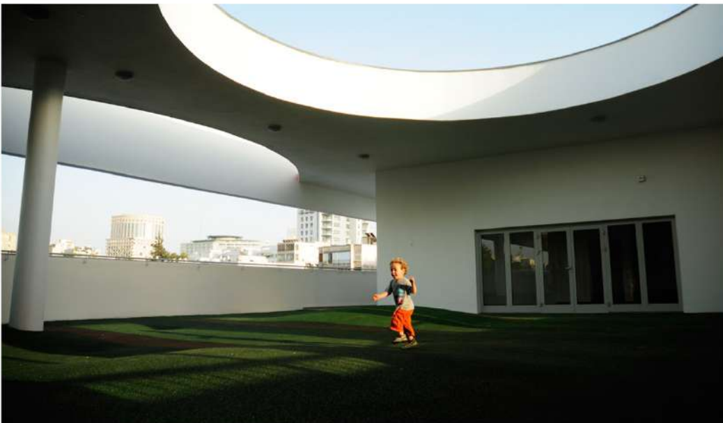
The kindergartens, built on two levels, are interwoven with a series of playful spaces