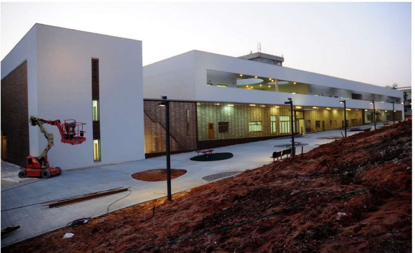
The 100 m long horizontal building of the children education wing, juxtaposed with the lightly sloped site