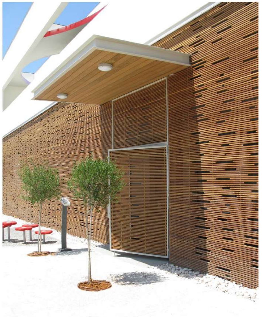
The eastern façade and the kindergartens' entrance: a contemporary variation of the Tel-Avivan brise-soleil tradition