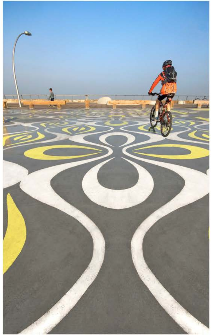
The Parking Park as a multipurpose surface