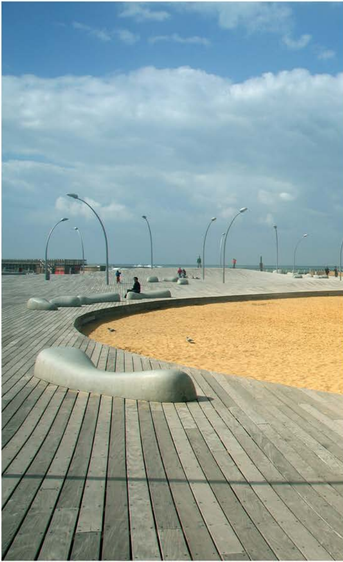
The undulating surface as a receptive and flexible environment, offering a variety of ways to experience space