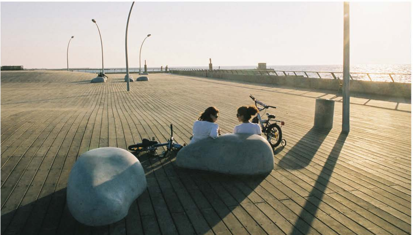
The GRC elements designed for a variety of sitting positions