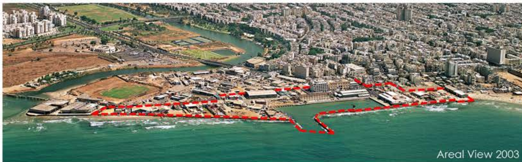
Areal View 2003

http://www.dezeen.com/2008/11/17/tel-aviv-port-by-mayslits-kassif-architects/