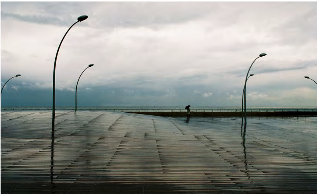
The undulating surface as a receptive and flexible environment, offering a variety of ways to experience space