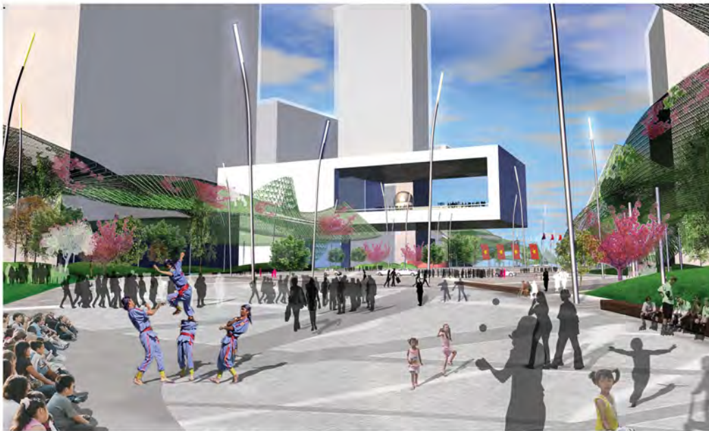
The Vietnam Gallery Cultural Center as an urban terrace hovering above the HCMC Plaza

Along the waterfront, the design proposes the creation of The Woodland Park . Implemented in the design are illuminated pavilions for various public activities, creating new spectacular waterfront views from the historic city of HCMC.