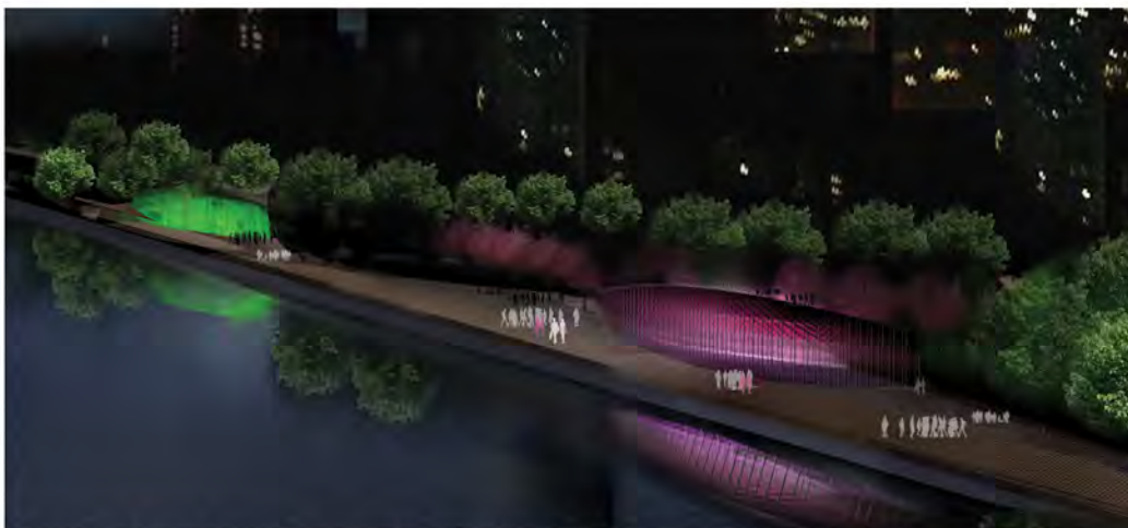
The Woodland Park along the east bank of the Saigon River as a new image of the city