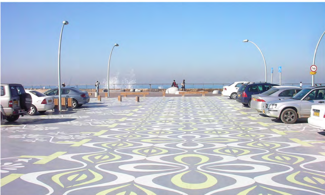
The Parking Park as a multipurpose surface