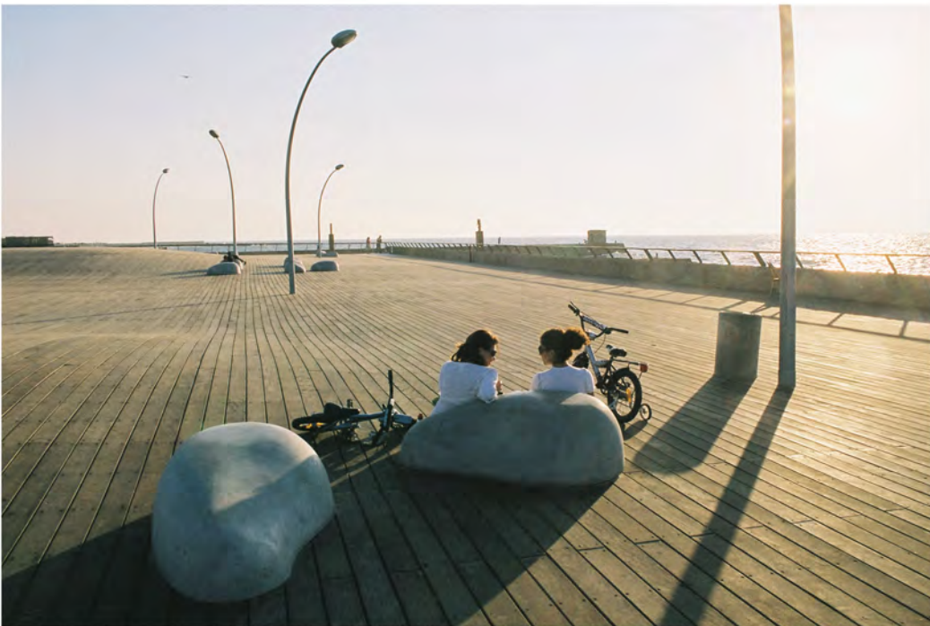
The GRC elements designed for a variety of sitting positions