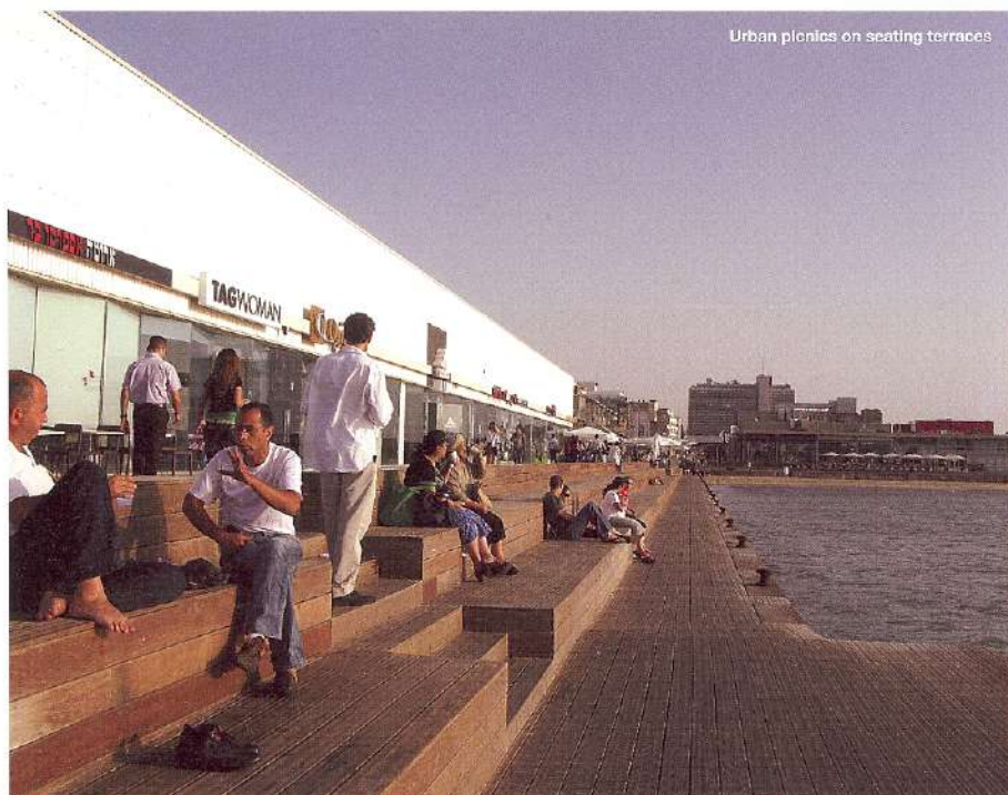
Urban picnics on seating terraces

TEL AVIV RESIDENTS reportedly couldn't wait for an official public space where communities would be able to freely gather and intermingle with one another – enthusiasts were flocking to the Tel Aviv Port to have some fun in the sun even well before the architects-in-charge – a young and burgeoning practice called Mayslits Kassif Architects – could commence their work on their widely publicized regeneration of the area's open spaces. A locale comprising an eclectic mix of houses, restaurants, bars, schools, studios, galleries and boutiques, the port's most unique feature is undeniably an expansive undulating surface